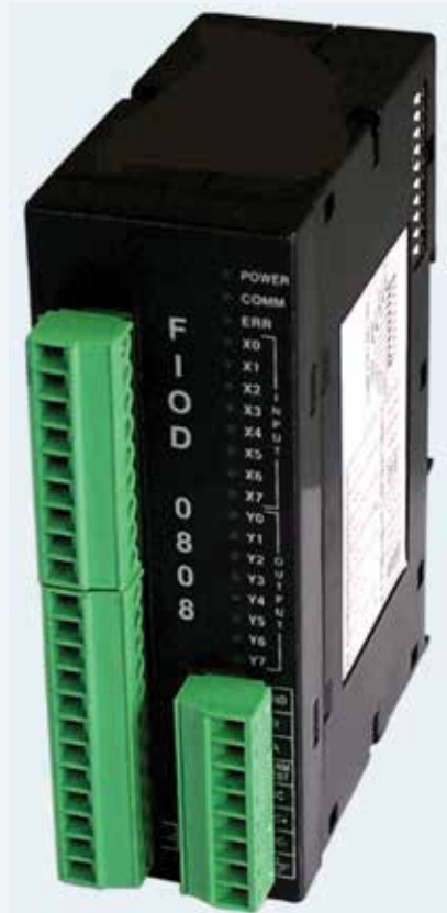
Field I/O Digital